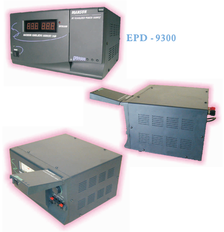
EPD - 9300